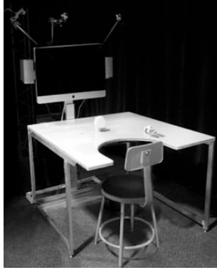
Fig. 1 HAMRR media center and table

The table is constructed from an aluminum tube frame and 8 ply MDO. The tabletop is 103 cm by 110 cm, with a height of 75 cm. The detachable table is lightweight and can be removed from the media center. The table has a semi-circular cutout, which is designed to provide support for the hand and arm throughout movements. The left arm support is hinged to provide a means for the participant to get in to and out of the chair. The table leg under the hinged arm acts as a grip to help support the participant as he or she stands up or sits down, as seen in Fig. 1.